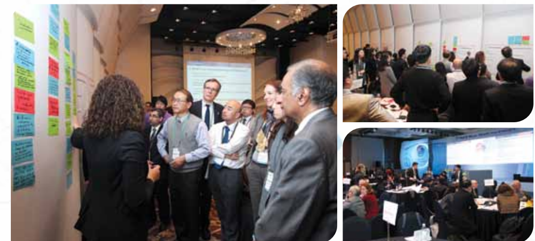
The Thematic Process Break-out Session of the 2 nd Stakeholders Consultation Meeting, Gyeongju, 27 February 2014

Your collaboration and contribution will make the 7 th World Water Forum a great success.