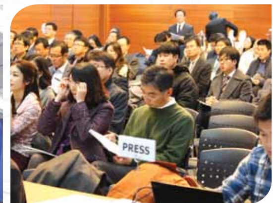
Press seats at the Expert Symposium, 6 November 2013