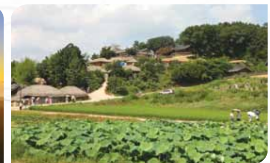
Daytime (Traditional Houses of Yangdong Village, UNESCO World Heritage)