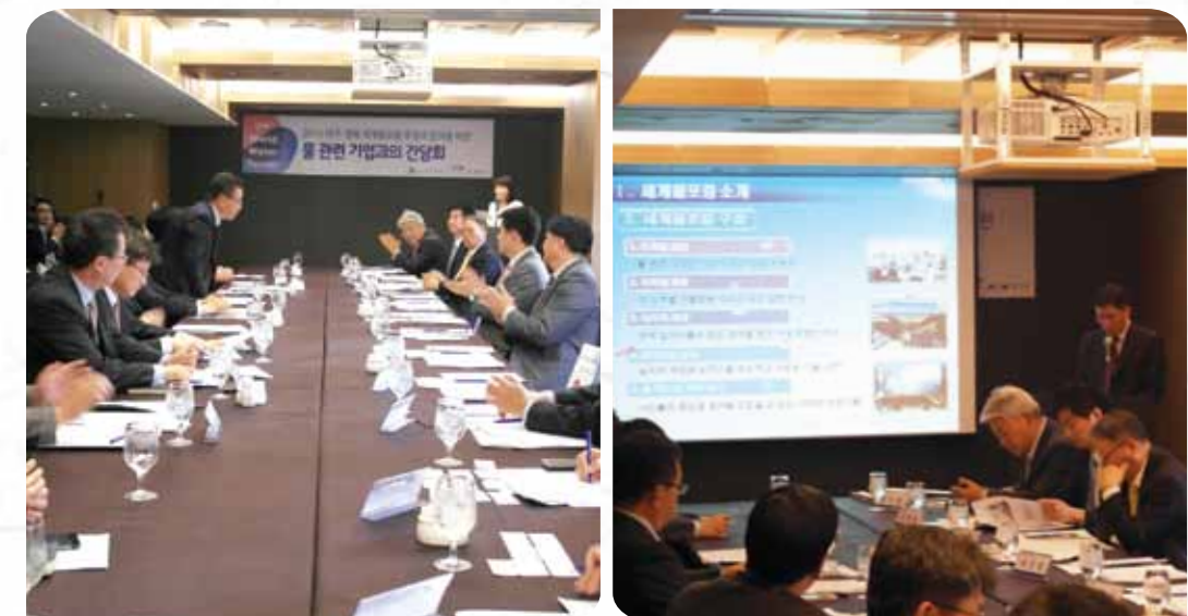
Meeting with water-related enterprises, 7 April 2014

The 7th World Water Forum provides a strategic opportunity for companies concerned by water issues to gain international exposure and recognition. Several corporate sponsorship categories will be made available for companies interested by this unique opportunity. Detailed information will be made available on the 7th World Water Forum's official website.