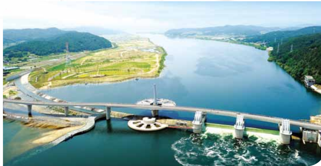
The Four Seasons of the Year, Daegu Summer (Gangjeong Goryeong Weir in the Nakdong River)

Daegu, with its population of around 2.5 million, is the third largest city of the Republic of Korea. The well-preserved ecosystems of the Nakdong and Geumho Rivers, and Shincheon stream that flow through the city are symbols of its accomplishments in sustainable development.