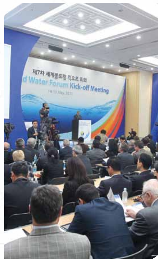
Media covering the 7 th World Water Forum Kick-off Meeting, 13-15 May 2013

Media contact: For further information such as special requests and interviews, please write to media@worldwaterforum7.org .