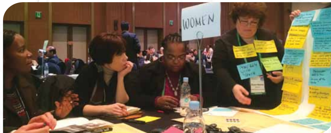
The Citizen's Forum Break-out Session of the 2 nd Stakeholders Consultation Meeting, Gyeongju, 28 February 2014

If you are a CSO with a water-related agenda, and want to create and execute your own program at the 7 th World Water Forum, you are welcome to submit your own proposal. You can develop various types of activities that can serve to enrich the Forum's program, such as sessions, exhibitions, cultural performances, and lectures. If you need more guidance or want to submit your proposal, contact citizens7@worldwaterforum7.org