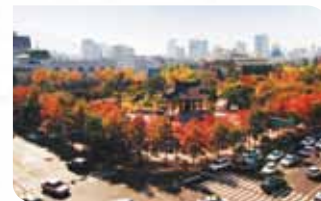
Fall (National Debt Redemption Park)