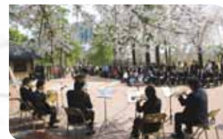
Spring (Outdoor concert)