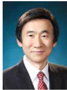
Yun Byung-se, Minister of Foreign Affairs

Water is the ultimate resource that can decide the fate of human civilization and history because it is an irreplaceable natural resource. That's why water is also called 'blue gold,' the last high value-added resource in the world.