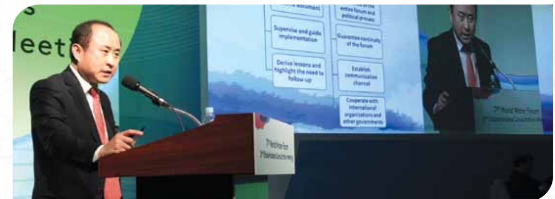
The Political Process Plenary Session of the 2 nd Stakeholders Consultation Meeting, Gyeongju, 27 February 2014

The Political Process will be informed by all the discussions of the other three Processes. If you want to get involved, contact our coordinators. You can find contact points in Appendix 3.