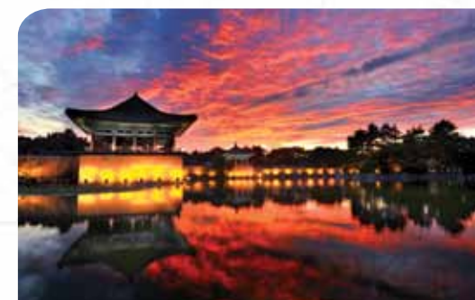
Sunset (Donggung and Wolji, the banquet hall of the Silla Dynasty)