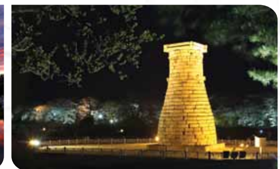
Night (Cheomseongdae, the orient's first observatory)