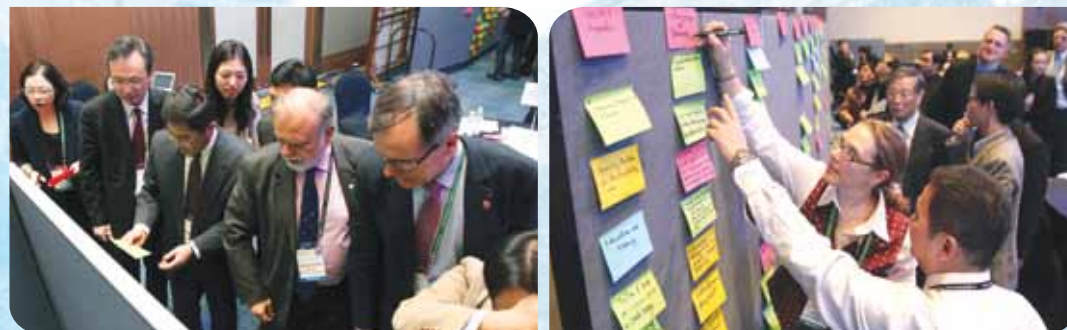
The Science & Technology Process Break-out Session of the 2 nd Stakeholders Consultation Meeting, Gyeongju, 28 February 2014