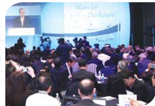
Official Opening Ceremony of the 7 th World Water Forum 2 nd Stakeholders Consultation Meeting (SCM), Gyeongju, 27 February 2014