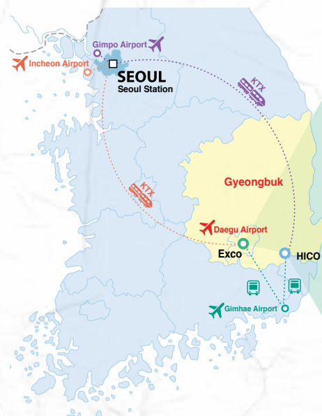
Access route for the Forum Venue