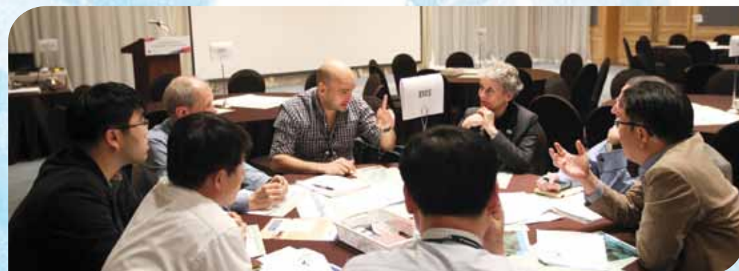
One of the Regional Process Break-out Sessions of the 2 nd Stakeholder Consultation Meeting, Gyeongju, 27 February 2014

Your collaboration and contribution will make the 7 th World Water Forum successful.