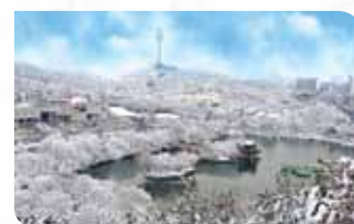
Winter (Duryu Park)