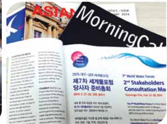
Advertisements on the 2 nd Stakeholders Consultation Meeting for the 7 th World Water Forum, 27-28 February 2014