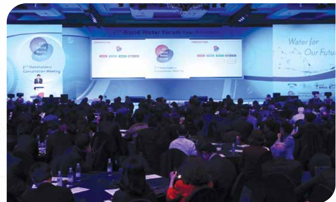
The Plenary Session of the 2 nd Stakeholders Consultation Meeting, Gyeongju, 27 February 2014

Please visit our Virtual Forum. http://eng.worldwaterforum7.org 'Virtual Forum' - 'Science & Technology Process'