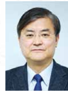
Suh Seung-hwan Minister of Land, Infrastructure and Transport

As the 7 th World Water Forum is just a year away, the expectation for the 7 th Forum has indeed been realized. Vague ideas have been articulated, and many people aware of the severity of water-related issues are taking part in the preparation of a successful Forum in 2015.